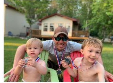
One last picture of warmer times... they will return in a few short months. Picture is of the Mathewson boys with their second place fishing medals.