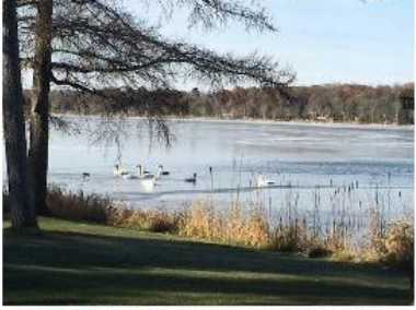
Jan Lodico took this picture of the swans when they returned recently. Notice the thin layer of ice on much of the lake.