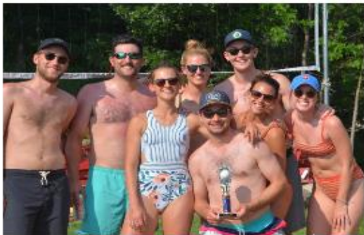
First Place Team