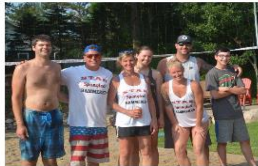
Second Place Team