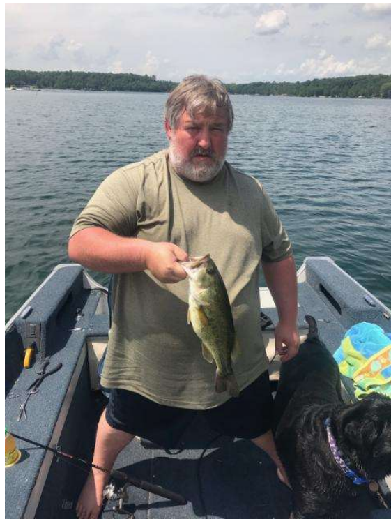
Team Morse Captain and 16 inch Bass