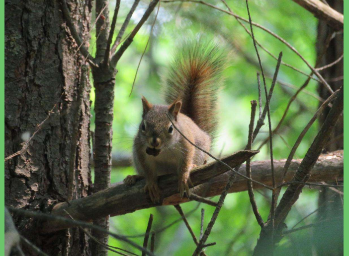
Leigh Rysdam took this picture while visiting her parents at the lake recently.